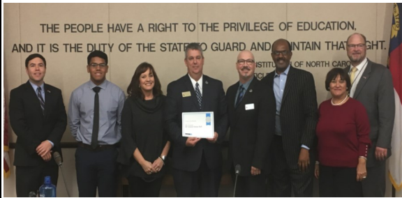
Clinton City Schools

We are extremely proud of the four NCAPP target districts that were recognized by the NC State Board of Education for their inclusion in College Board's 8 th Annual District Honor Roll. Clinton City Schools, Montgomery County Schools, Nash-Rocky Mount Schools, and Yancey County Schools all received congratulatory certificates during the December board meeting. In order to receive recognition, districts must simultaneously increase access to Advanced Placement® courses for a broader number of students while maintaining or improving the rate at which their AP® students earned scores of 3 or higher on an AP Exam.