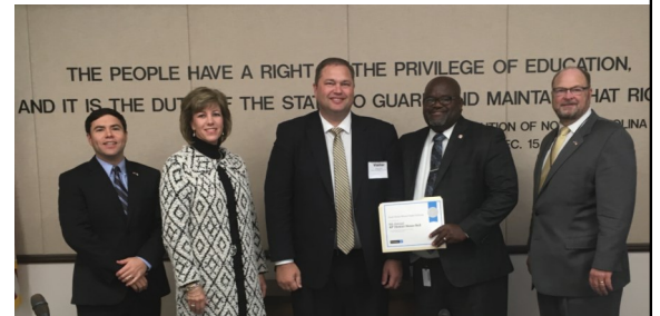
Nash-Rocky Mount Schools

We are extremely proud of the four NCAPP target districts that were recognized by the NC State Board of Education for their inclusion in College Board's 8 th Annual District Honor Roll. Clinton City Schools, Montgomery County Schools, Nash-Rocky Mount Schools, and Yancey County Schools all received congratulatory certificates during the December board meeting. In order to receive recognition, districts must simultaneously increase access to Advanced Placement® courses for a broader number of students while maintaining or improving the rate at which their AP® students earned scores of 3 or higher on an AP Exam.