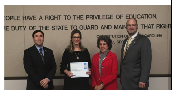
Yancey County Schools