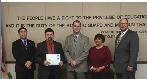
Montgomery County Schools